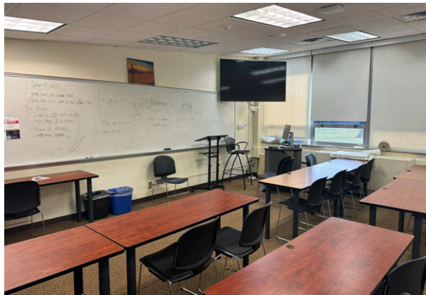
WEST WING BEFORE